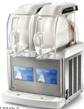
GT TOUCH 2

Electronics, design and technology are combined in a single unit that is ideal for convenience stores, take-away shops, bars, restaurants and cafes.