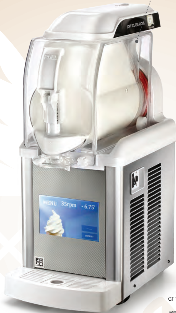
GT TOUCH 1